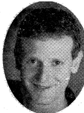
COMEDIAN ROBBY PRINZ

For more information, call 669-2660 or log onto www.HeadlinersComedyClub.com . Cover will vary from $15 to $20 for Saturday evening shows.